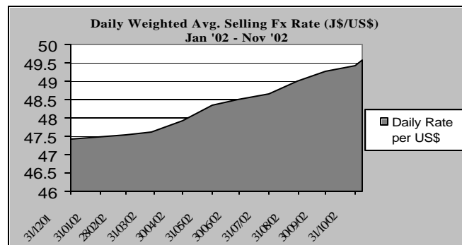
Table 3: Foreign Exchange Trends